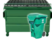
GREEN = ORGANICS

Do you need to start or improve your recycling and organics program? ACI can help.