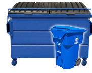
BLUE = RECYCLABLES

All occupied properties in Alameda must subscribe to adequate levels of service for recyclables, organics, and garbage.