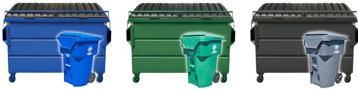
BLUE = RECYCLABLES GREEN = ORGANICS GRAY = GARBAGE