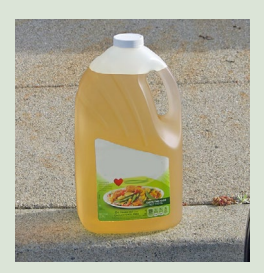
USED COOKING OIL