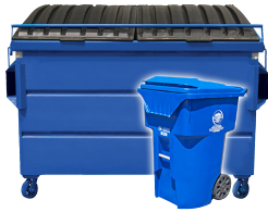
BLUE = RECYCLABLES

Help our community to reduce waste, conserve resources, and comply with State and local laws.