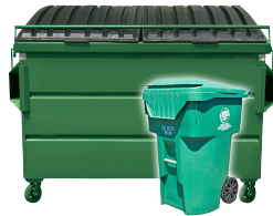
GREEN = ORGANICS