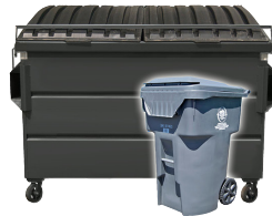
GRAY = GARBAGE

Whether moving in or moving out, your recyclables, organics, & garbage must "move" into the correct collection bin.