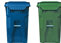
CART BUNDLED CONTAINERS - EQUAL TO SIZE OF GARBAGE CONTAINER (CONTAINERS LARGER THAN GARBAGE CONTAINER WILL INCUR A SUPPLEMENTAL FEE)