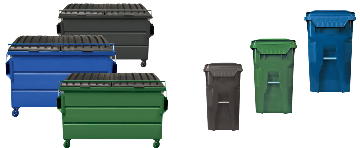
A LA CARTE CONTAINER(S) - ANY MATERIAL, ANY CONTAINER, ANY SIZE, ANY FREQUENCY

*PLEASE NOTE: Bins and carts cannot be combined in a single bundle. A customer can have multiple separate bundles (bin bundles and cart bundles) on one account.