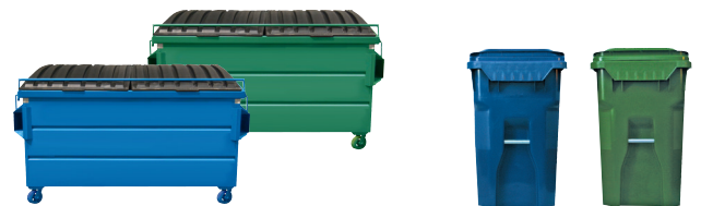
BIN SECOND CONTAINER - 1 - 3 CUBIC YARDS, ANY MATERIAL OTHER THAN FIRST CART SECOND CONTAINER - 32 - 96 GALLONS, ANY MATERIAL OTHER THAN FIRST CONTAINERS LARGER THAN FIRST CONTAINER WILL INCUR A SUPPLEMENTAL FEE ADDITIONAL FREQUENCIES OF SERVICE WILL BE CHARGED AT THE A LA CARTE RATE.