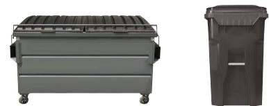
BIN FIRST CONTAINER - 1 - 3 CUBIC YARDS, ANY MATERIAL CART FIRST CONTAINER - 20 - 96 GALLONS, ANY MATERIAL (20 GAL AVAILABLE FOR GARABGE ONLY)