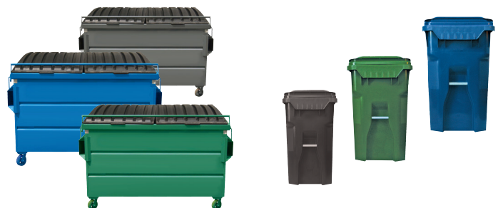
A LA CARTE CONTAINER(S) - ANY MATERIAL, ANY CONTAINER, ANY SIZE, ANY FREQUENCY