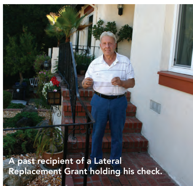
A past recipient of a Lateral Replacement Grant holding his check.

A CCTV permit must be obtained from CVSan, and the inspection must be witnessed and reviewed by a CVSan inspector. For more information about Ordinance No. 179 or to check your property's compliance status, please visit CVSan.org/PSL .