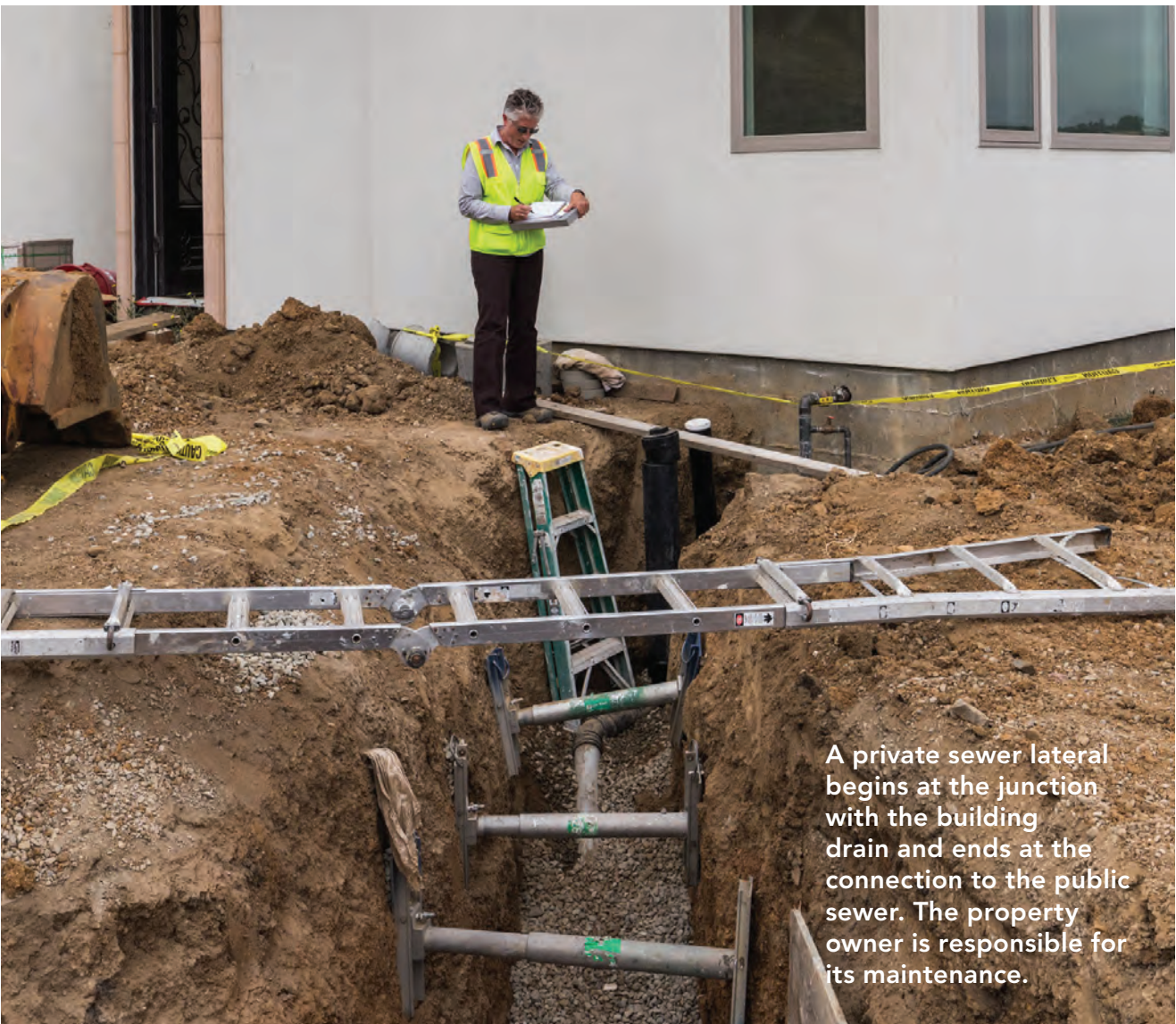
A private sewer lateral begins at the junction with the building drain and ends at the connection to the public sewer. The property owner is responsible for its maintenance.